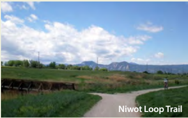
Niwot Loop Trail